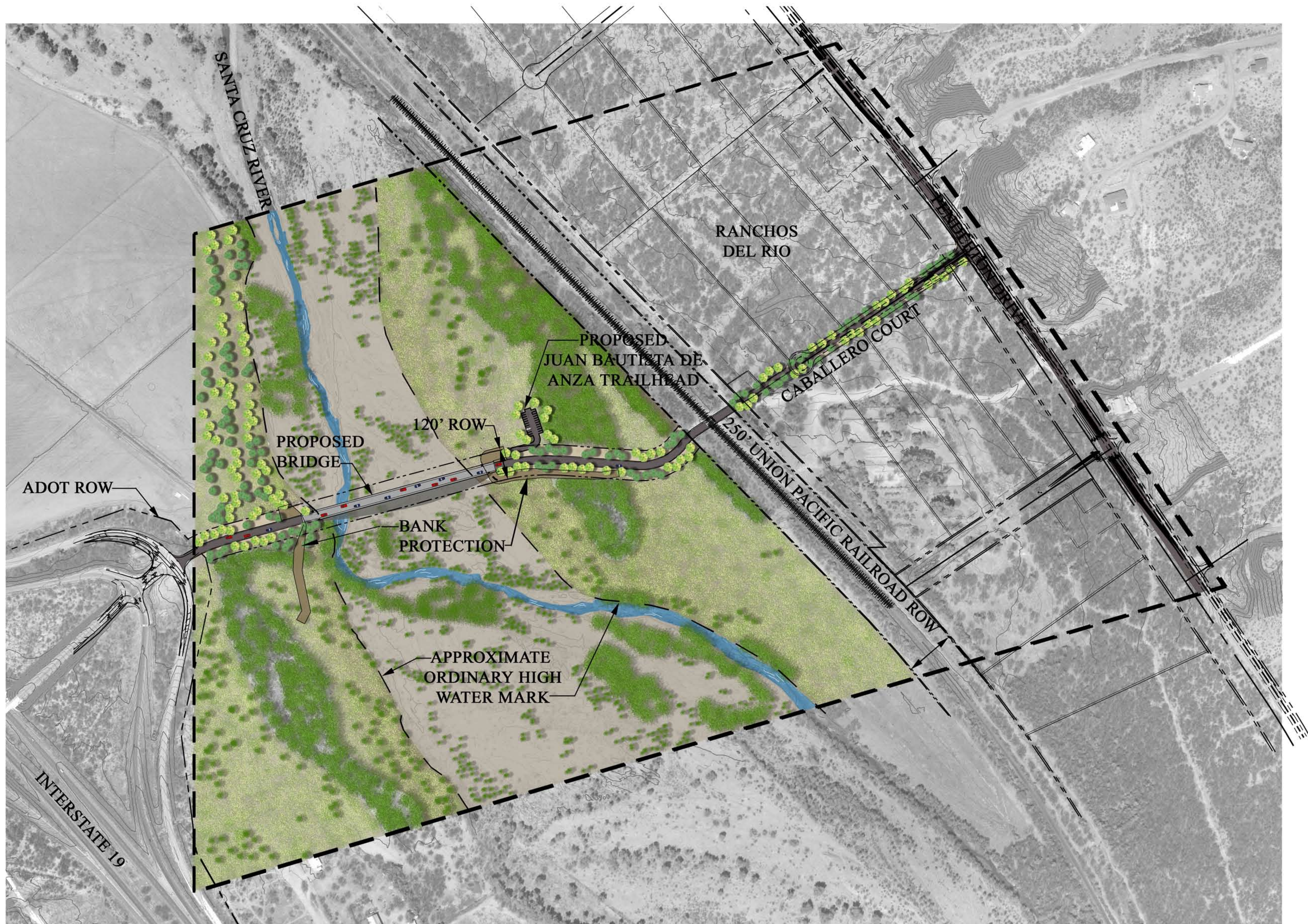
PLAN VIEW OF PROJECT AREA